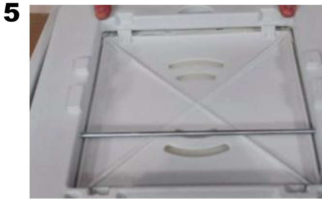
5 Clip other side into locked position by pushing down from top of seat pad until you here it snap into place