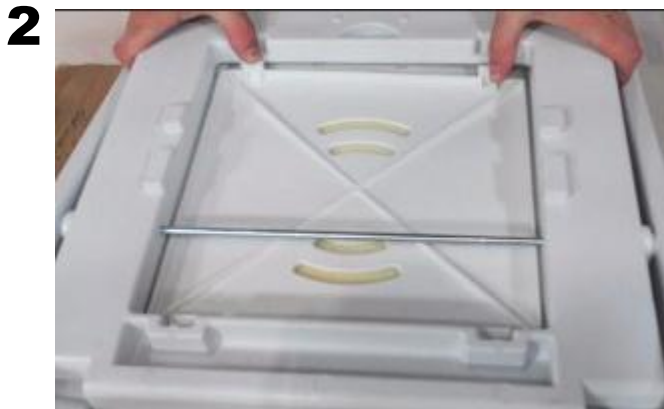
2 Repeat step 1 for the other side of the seat pad.