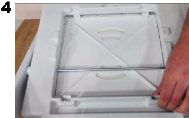
4 Gently slide the new seat pad into place and secure by putting clips into the locked position.