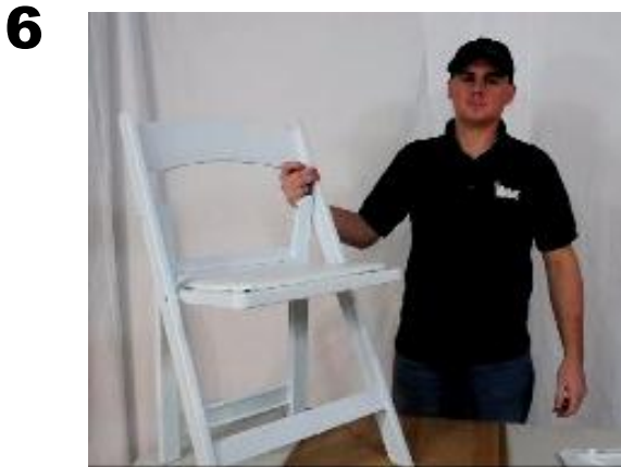
6 Your Revolution Seat Pad is Replaced!