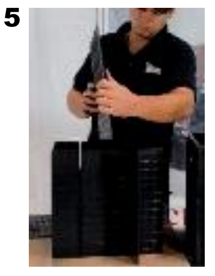
Insert another two panels into your assembly.

Hold one panel with slots facing up and insert another panel with slots facing down.