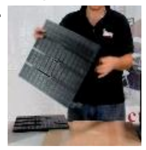
Carefully turn over your assembly.