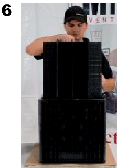
Carefully pick up your assembled Dividers and place into your Charger Plate Crate.