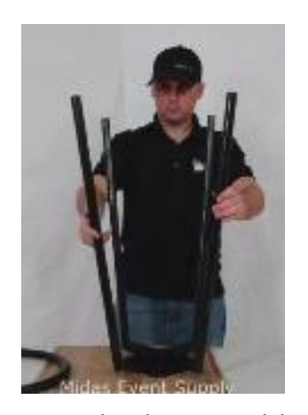
Flip over the bar stool base