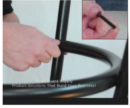
Line up the holes and use the longest screws to fasten.