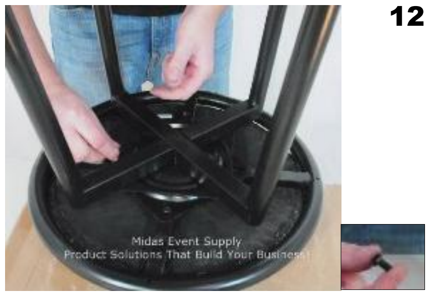
Place seat pad on table with underside facing up. Place the base on top of seat pad, lining up holes on the seat pad and swivel. Fasten with the shortest screw.