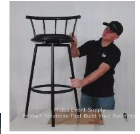
Your Contemporary Black Metal Bar Stool is Assembled!